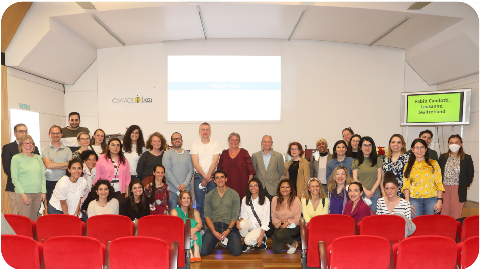
Session held at IASO Hospital 6th of May 2022 Athens, Greece