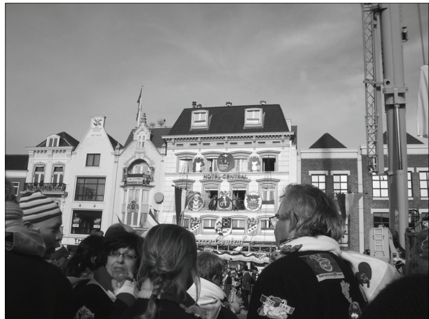
The Hotel Central on the Markt, one of the Congress hotels, during Carnival this year

The social program is also very interesting, and gives you all a good chance to renew all friendships, and start new ones!